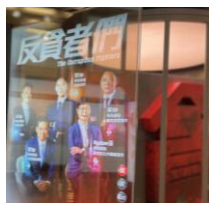
Four Thematic Zones, and more